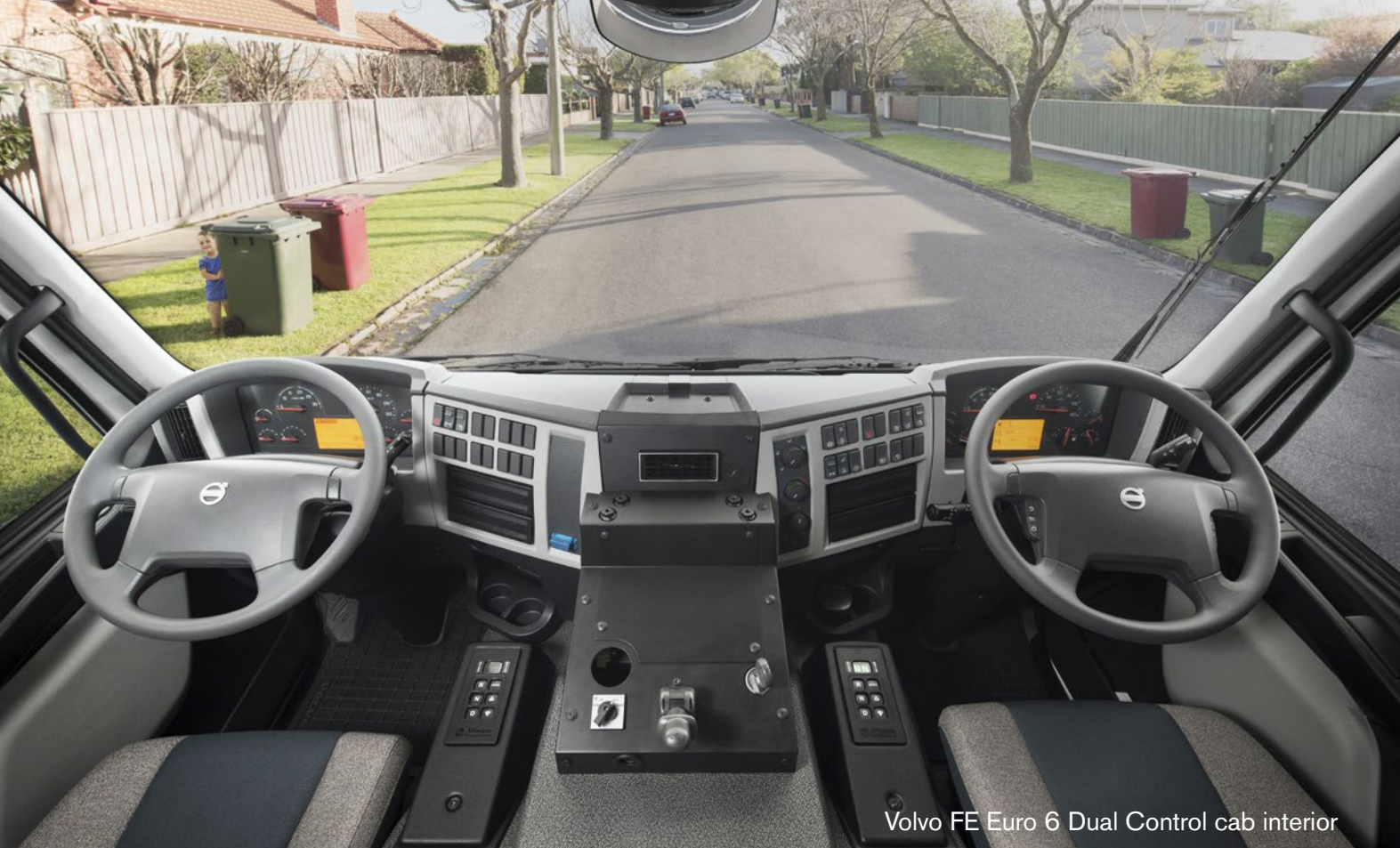
Volvo FE Euro 6 Dual Control cab interior