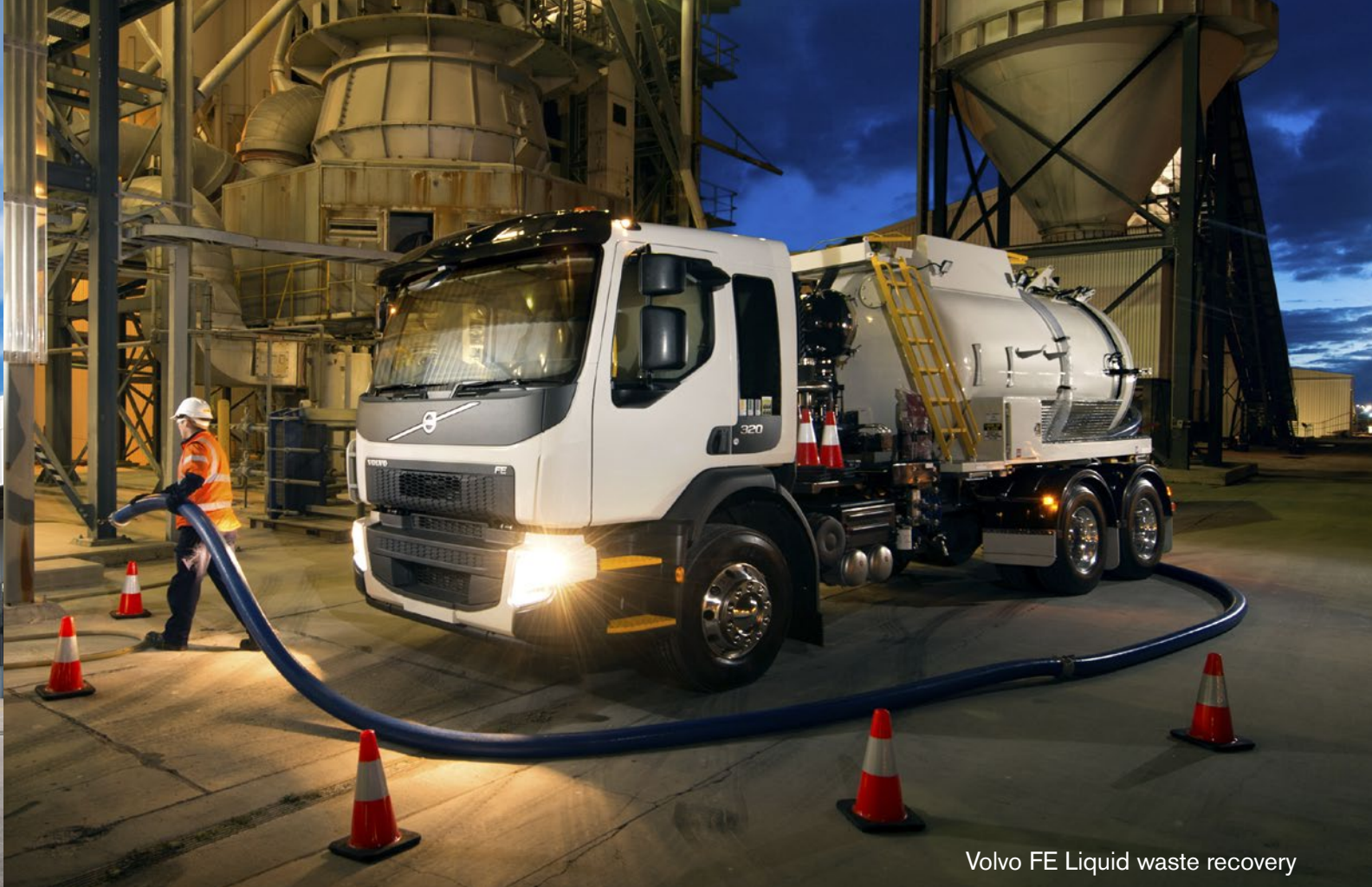
Volvo FE Liquid waste recovery