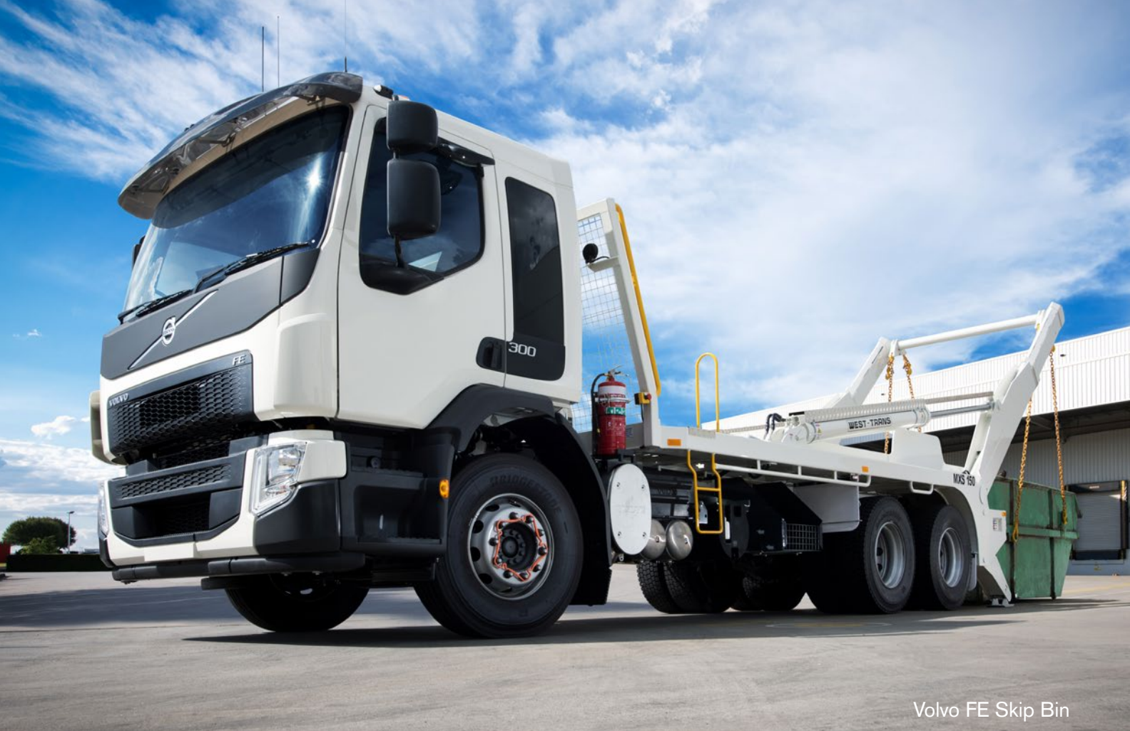
Volvo FE Skip Bin