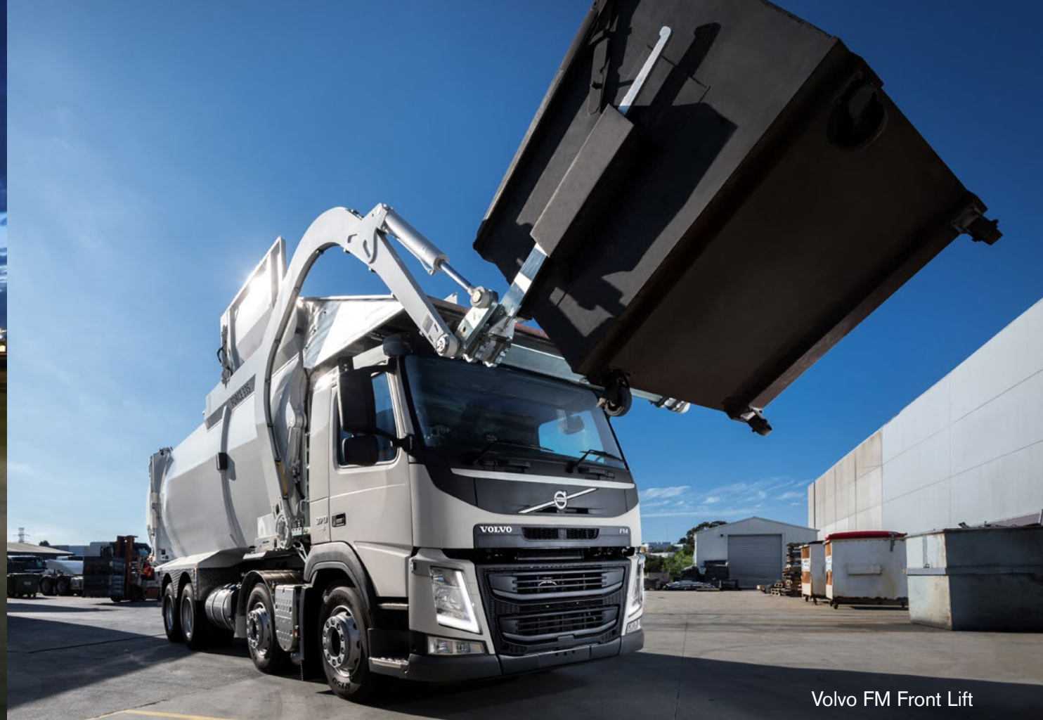
Volvo FM Front Lift